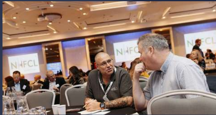
Dynamic digital wallpaper on the ballroom walls

Platinum, Gold & Silver partners can showcase their logos on the dynamic digital wallpaper displayed on the walls of the Grand Ballroom (pictured below), which will host the plenary and closing sessions.